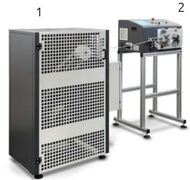
Inline assembly example: 1 Motorized dereeler 2 Cut, strip & unjacket machine