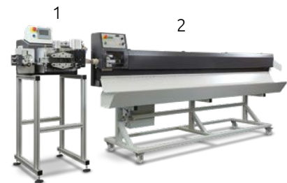
Inline assembly example: 1 Automatic cutting machine 2 Stacker